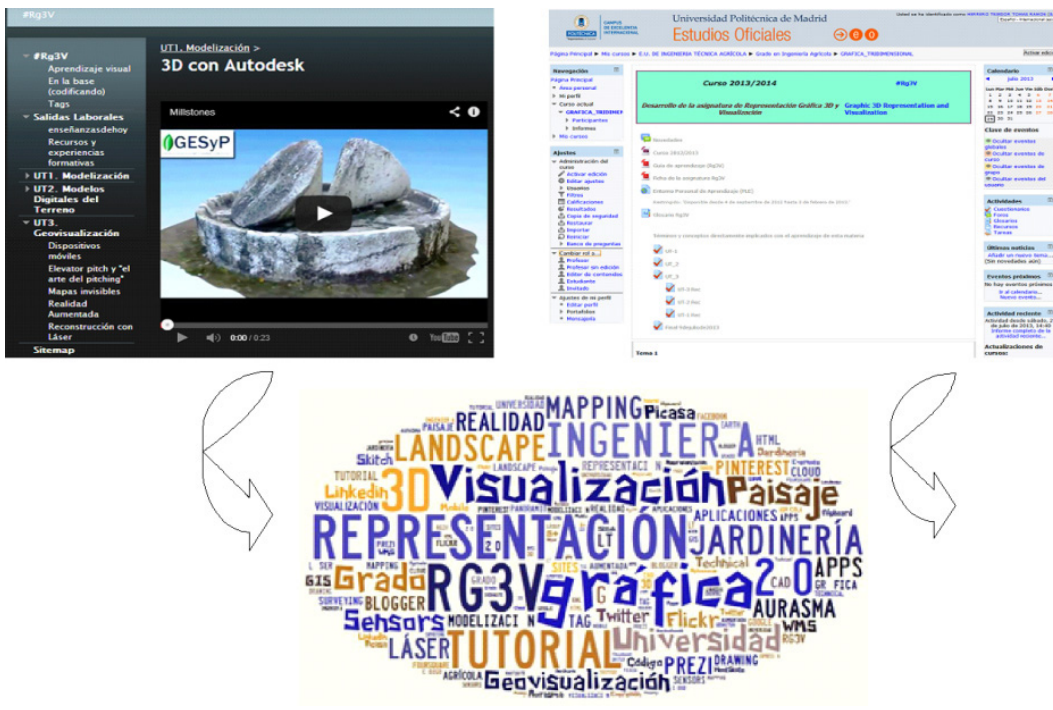
Fig. 4. Rg3V learning guide

With these elements and scenarios 2.0, the students are able to acquire the three learning outcomes corresponding to the three thematic units of the subject Rg3V: Modeling, digital models of terrain (MDT) and Geovisualization.