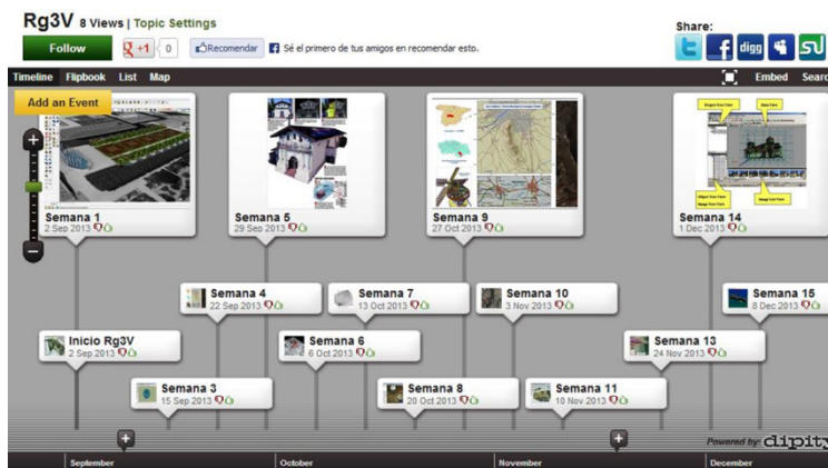
Fig. 2. Timeline of the tutorial 2.0

For educational planning of the subject of Rg3V and as part of the tutorial 2.0, the resource of the Timeline (LT), generated with the Dipity Software, has been used (see Fig. 2). This tool allows to sort a sequence of events on the subject, in order to clearly display the temporal relationship between them. It also adds and links intuitively interactive content that serves to guide the student. This aims to improve the teaching-learning process [6].