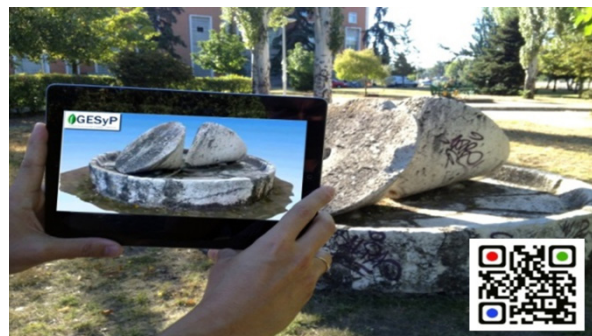
Fig. 3. Virtual model 3D and image

The "reverse engineering" is to obtain information or a design from a product accessible to the public, in order to determine of what is made, what makes it work and how it was made. The cycle of this process is: construction - final design - basic design - pre-design. Based on this cycle, characteristic examples of each of the three thematic units (UT) that contains the subject Rg3V (and therefore the 2.0 Tutorial) have been represented graphically. These examples are designed in 3D computer graphics, animated, accessible and can be manipulated.