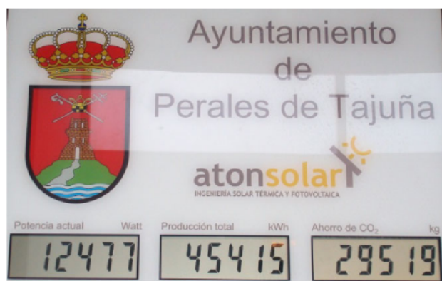
Figure 1. Information panel at a sport centre in a village of Spain, showing the \text{CO}_2 emissions (29519 kg \text{CO}_2 ) avoided by using solar power rather than carbon-based fuels for a power source. A total production of energy of 45415 kWh is shown.

Really, the information indicated on dentifrice packages is given usually as the equivalence between fluorine com-