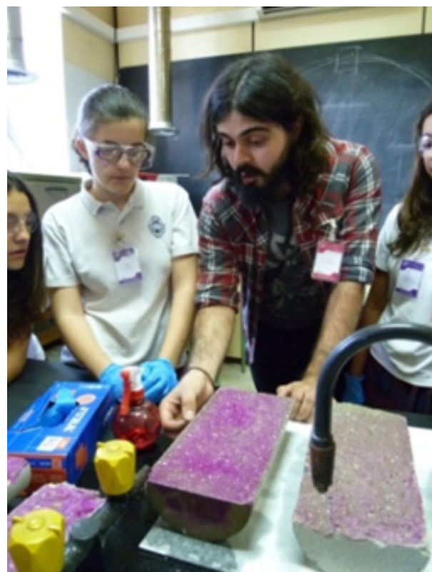
Figure 6. Activities in the Workshop "Civil Engineering and Construction": Degradation of concrete through the carbonation process.