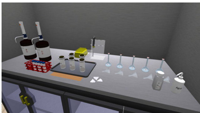
Figure 4. Room 2 of the Chemistry Experimentation virtual lab: Hoods, with the material for sample dilution.

This virtual lab practice was designed to be included in the program of the subject Environmental Science of the Degree in Civil Engineering [18]. It has been used since the academic course 2014/15, always after the realization of a face-to-face lab practice, using the materials and equipment available in the Chemistry laboratory. For the academic courses 2014/15 and 2015/16, students' opinion on virtual lab practice has been collected through surveys, the times