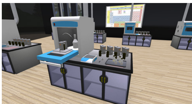
Figure 3. Room 3 of the Chemistry Experimentation virtual lab: Microwave oven and fridge

To develop this virtual lab practice, it has been necessary to create different types of materials, apparatus and instruments, with many details which give them a most real aspect (Figures 3 & 4). Students access the virtual world perfectly identified, through an avatar that they must create from a user name and password.