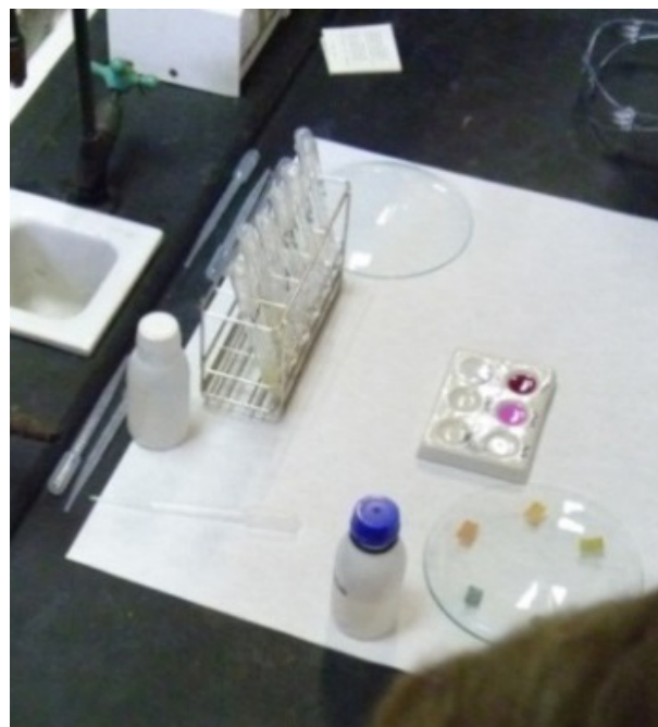
Figure 5. Determination of pH of several well-known substances.

sieved in the previous activity for different experiments. They observed the fracture faces of the coarser fraction and performed a methylene blue test to determine the clay content in the fine fraction (Figure 7). Afterwards students analyzed bitumen hardness/brittleness by determining the softening point by "ring and ball" method.