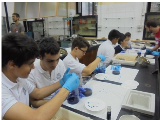
Figure 7. Activities in the Workshop “Civil Engineering and Infrastructures”: Methylene blue test for the determination of the clay content in the fine fraction of a soil sample.