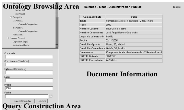
Figure 2. System User Interface.

Document Viewer connects to the Search Server, in order to retrieve the legal documents satisfying the query, and to the Ontology Server to browse and display the documents. Figure 2 shows the system user interface. On the left side we can see the ontology browsing area and the query construction area, and on the right side the document information.