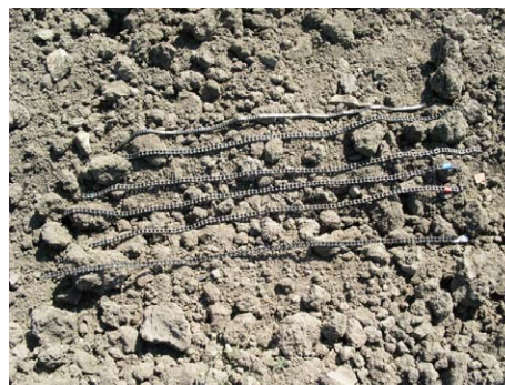
Figure 3. Chain set. Field measurements. Soil tilled with chisel.

In order to express the results obtained from pin meter as SSR, as global soil surface roughness over an area of 1.0 m 2 , the present study used the standard deviation (SD) measured between all the data points. The SD accounts for the random and oriented soil roughness. A second index, the coefficient of variation (CV), was used in addition to standard deviation. While the SD results were expressed in cm, CV was expressed as a percentage.