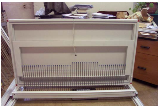
Figure 2. Experimental pin-meter.