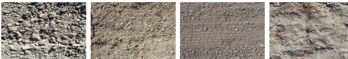
Figure 1. Shadow analysis, sandy clay loam soil tilled with chisel, tiller and roller, and control, left to right.

The pin meter method (Figure 2) was selected as a reference to the field shadow analysis measurements in light of the reliability of this technique (García Moreno et al. 2008b). The prototype consisted in a row of 35-cm high pins, placed in a frame in which they could slide up or down to conform to surface irregularities. The pin heads were marked with a blue band to better visualize their respective positions when in contact with the soil. The device was designed to be moved horizontally without disturbing pin patterns. With rows containing 50 pins spaced at 2-cm intervals, each x-axis reading covered one full metre of ground. The images displayed by the pin meter at the different positions, parallel to direction of tillage, were recorded with the camera installed in a Silk tripod adjusted at the middle of the vertical and horizontal distance of the device, in order to avoid the distortion of the images. A program in visual basic was developed to translate the different pin positions of the different images into soil micro relief data.