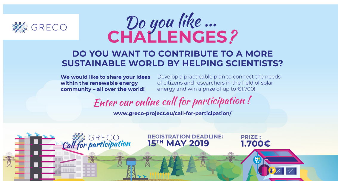
Figure 1. Call for ideas to design a PV citizen science initiative.

The highest score and hence the major prize was awarded to the proposal “Open database of rooftop solar PV installations”, which fully satisfied the characteristics demanded for GRECOs’ Citizen Science initiative (in particular, relevant citizen participation to respond to a relevant research question) while keeping its development within the framework of what the